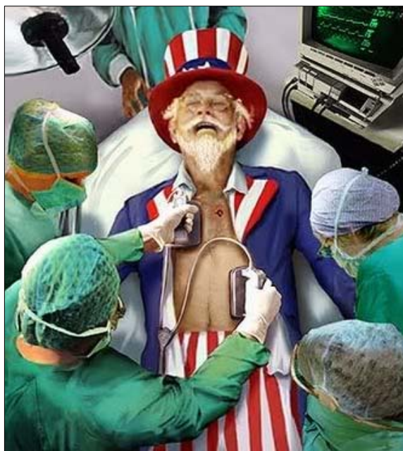
Is Uncle Sam on his death bed? He seems to always recover from his ailments, but can he this time?

Enough for the digressing and sarcasm - back to the question on how politicians make their decisions. They must first protect their jobs, so they can't vote on any-