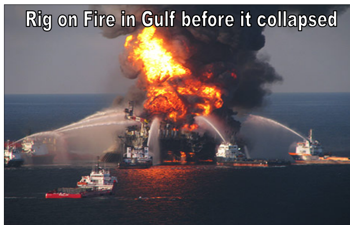
Rig on Fire in Gulf before it collapsed Although the following passage sounds more like a volcano, the results could be the same. Rev 8:8 "And the second angel sounded, and as it were a great mountain burning with fire was cast into the sea: and the third part of the sea became blood"

We are on the roller coaster that is on its way down and there is no way to stop it short of Jesus Christ's return. Scripture tells us that this roller coaster will eventually affect the lives of every man, woman, and child.