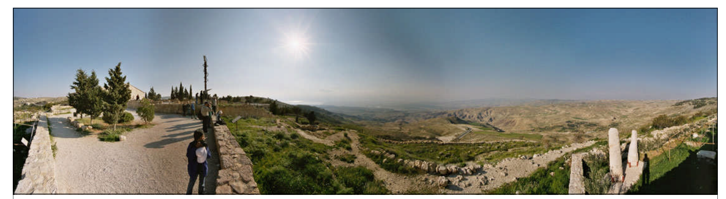
The above picture shows the view Moses would have seen from the top of Mt. Nebo. The picture above is covered in greater detail in this ser-