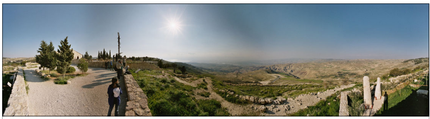
The above picture shows the view Moses would have seen from the top of Mt. Nebo. The picture above is covered in greater detail in this ser-